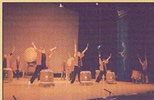
Howzat!? Students from West Leeds High School perform at the Breeze Festival