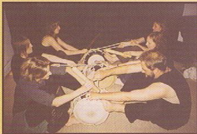
Shime tying practice for Project Taiko at the dojo