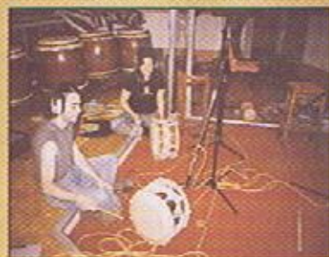
Adam and Miyuki practice the art of cheese rolling at Core