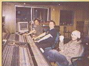
Mixin' it at CaVa