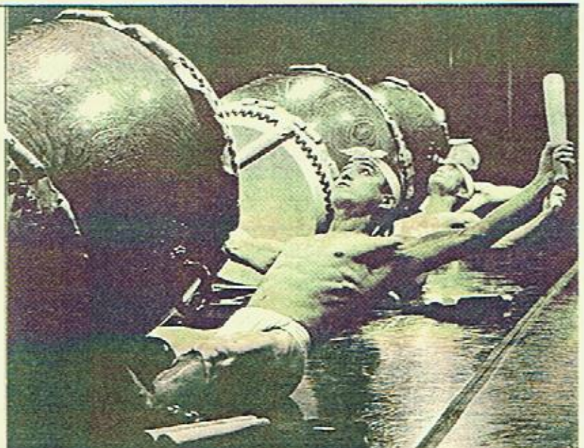
THE KODO DRUMMERS

Earlier in the year, Mugenkyo advertised for apprentice Taiko drummers in the Glasgow area. We had an overwhelming response: 400 people applied for two places, and we could hardly keep up with the phone calls!. We're sorry that we weren't able to offer everyone interviews or auditions. We'd like to thank everyone who did apply, and hope that we can see you at the Mugenkyo Taiko classes, which will be starting in the autumn (details in future issues of TAIKOTAIKO) We will be recruiting again in the future - mainly through the newsletter and classes, so if you're keen, please do apply again. WATCH THIS SPACE!